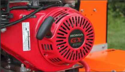
Electric start Honda GX 390 engine