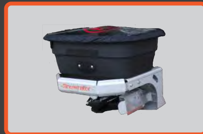
SR-Hopper 120 lb. electric