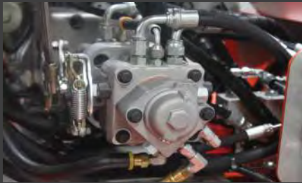
Direct Drive Dual Pump wheel motor transmission