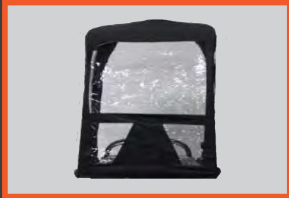
SR-Canopy Kit Operator Cover