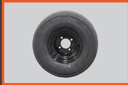
SR-Turf Tire Kit