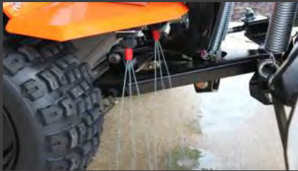
20 Gallon de-icing spray system