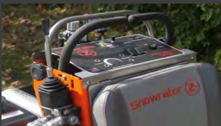
Joystick skid steer operation