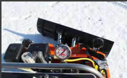
All hydraulic blade movement with float option and downforce