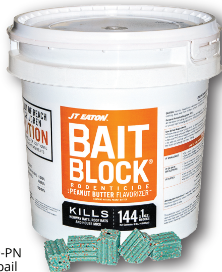
#709-PN 9-lb pail