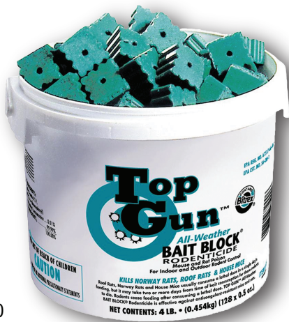
#750 4-lb pail