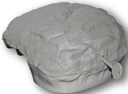
#928GR-PAV (Paver; weighted)