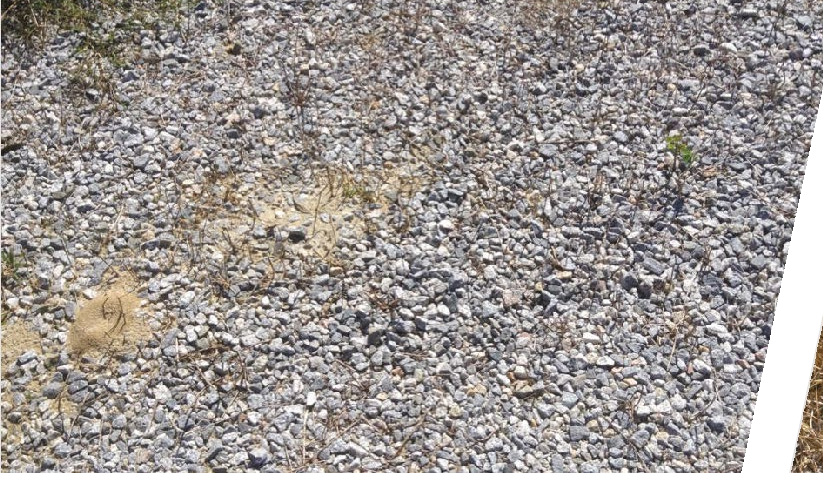
Roundup QuikPro<sup>®</sup> SC Total Herbicide 16 fl. oz./1,000 sq. ft. Bayer, Clayton, NC, 2012, HE12NARDS3