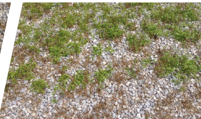
Roundup QuikPro® SC Total Herbicide 16 fl. oz./1,000 sq. ft. Bayer, Clayton, NC, 2012, HE12NARDS3

Glyphosate 0.73 fl. oz./1,000 sq. ft. Bayer, Clayton, NC, 2012, HE12NARDS3