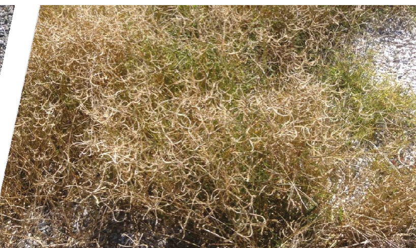
Glyphosate 0.73 fl oz./1,000 sq. ft. Bayer, Clayton, NC, 2012, HE12NARDS3

ALWAYS READ AND FOLLOW LABEL INSTRUCTIONS. Not all products are registered in all states. Bayer®, the Bayer Cross, Roundup® and Roundup QuickPro® are registered trademarks of Bayer Group. All other trademarks are the property of their respective owners. ©2023 Bayer Group. All rights reserved.