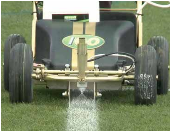
The iGO is used by thousands of grounds staff around the world.

All iGOs come with a simple on-off power button that gives the operator full control, a heavy duty pump that ensures constant pressure, a rechargeable battery that can be charged on the machine or removed and charged off site, marker discs and a variety of the unique cone nozzles.